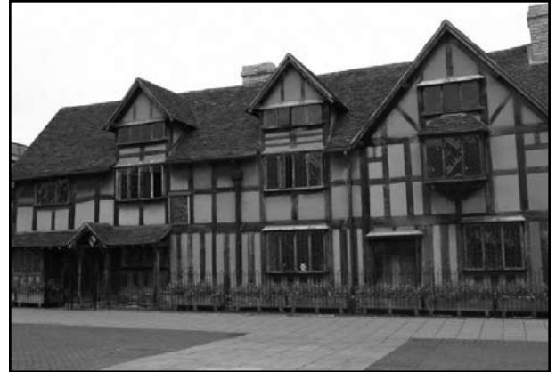
Shakespeare's house in Stratford-upon-Avon

It appears that by 1592, Shakespeare had arrived on the theatrical scene as a playwright in London. He apparently had earned enough notoriety to be called "an upstart crow" by fellow (jealous?) writer Robert Greene. By 1594, the "upstart crow"